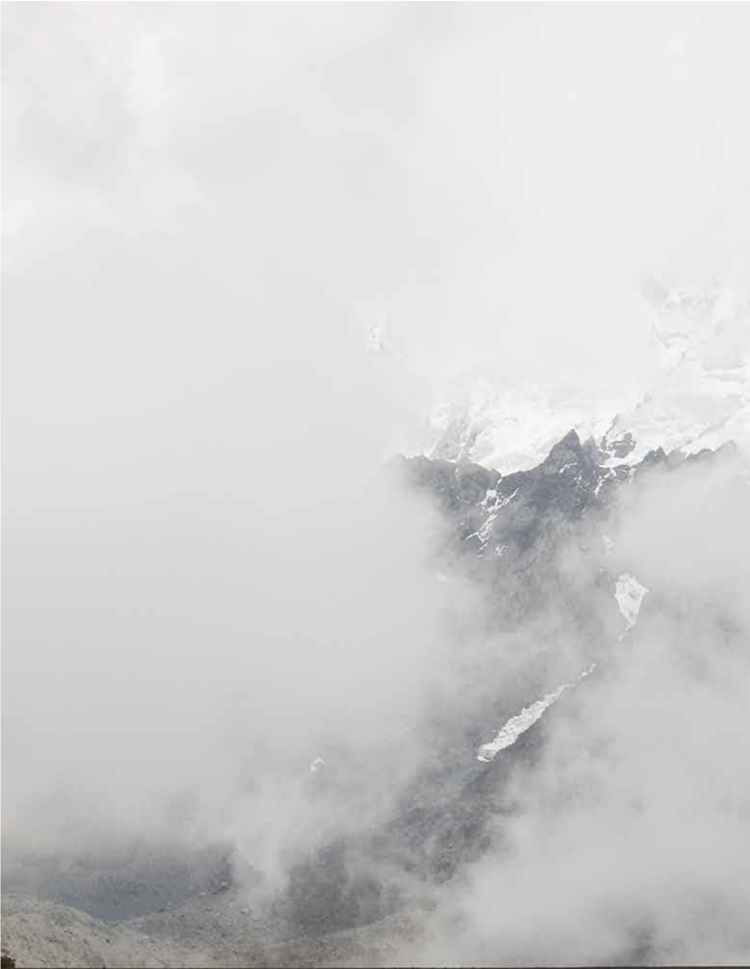
Southern Interoceanic Road Corridor, Peru.