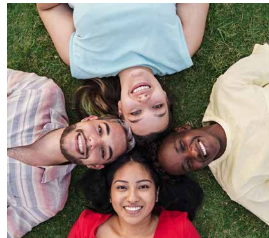
Gender, inclusion and diversity