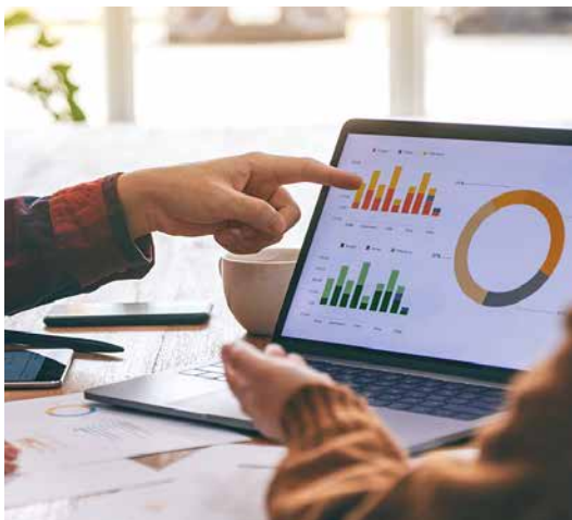
Mobilization of financial resources