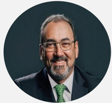
Sergio Díaz-Granados Executive President, CAF

“At CAF, we understand governance and public innovation as the right environment for legitimizing government actions, through institutions with clear procedures and rules, capacity, efficiency, transparency, and agility in responding to citizen demands”